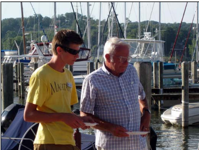
What do you think Lee?