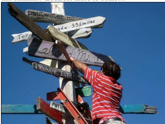
One of the Odd Jobs performed by your marina manager.