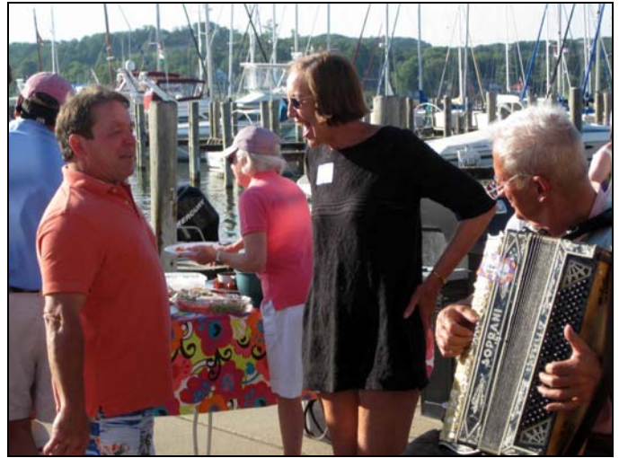
Is Tom Telling Stories again?