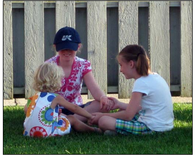
Some Quality Kid Time...

“Eldean Shipyard” is on Facebook . It is a great way to stay in touch with friends and family. Throughout the year we have posted photos and updates to our Facebook Page. You will find more our party photos on Facebook.