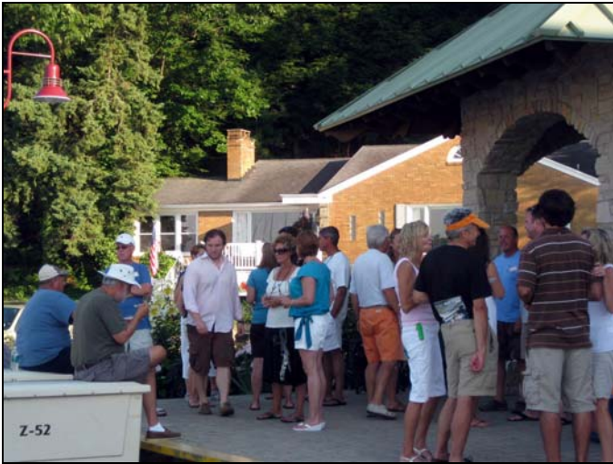
A & Z Dock

The 4 th Annual Dock Parties have been a lot of fun! Thank you for joining us! The food tasted fantastic! The most boaters attended the D & E dock party and there was barely room on the tables to accommodate all the great appetizers. Fortunately, we were blessed with sunny skies for all 3 parties.