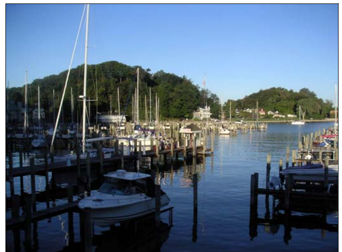
A calm & sunny fall morning at the Docks