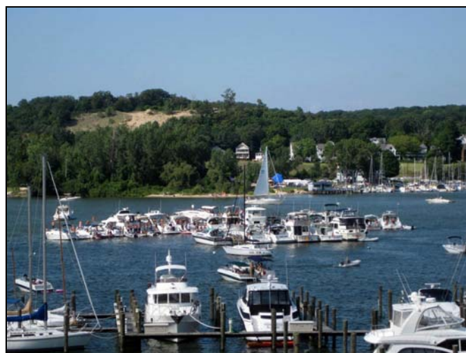
View from Z-dock

It's a little fuzzy, but it appears that there are 3 or 4 singers and a guitar player set up on the swim platform of this Sea Ray. There were some good voices and some not-so-good voices.