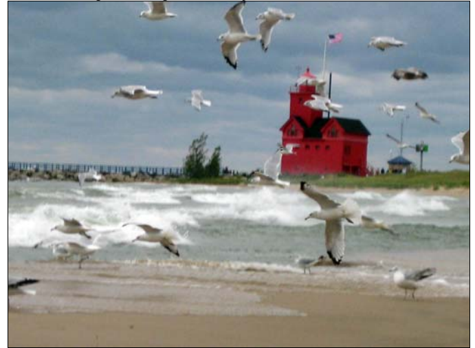
A windy September Day on Lake Michigan