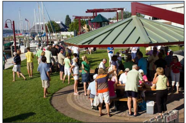
D & E-Dock Party 2010