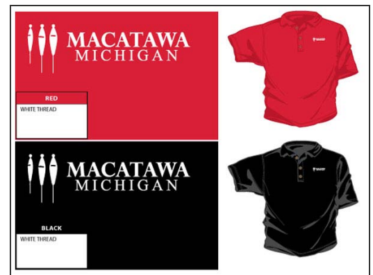
'4 in 1 Performance Polo': moisture wicking, anti-microbial, UV protection & anti-static