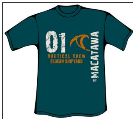
A new perspective on the our Shipstore "Crew" Uniforms