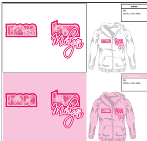
Ladies Zip-up Hoodies

This years clothing selection has arrived in the Shipstore. You'll see that we brought a few favorites back this year along with a variety of new Macatawa Clothing and Gil apparel.