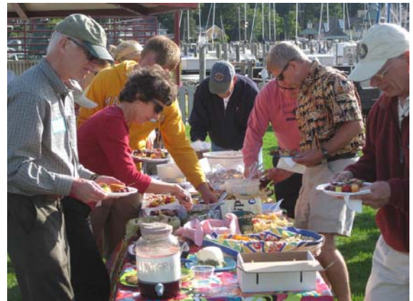
D & E-Dock Party, July 2009

D & E-Dock 6:30 pm, Saturday, June 26 B & C-Dock 6:30 pm, Saturday, July 10 Z & A-Dock 6:30 pm, Saturday, July 17