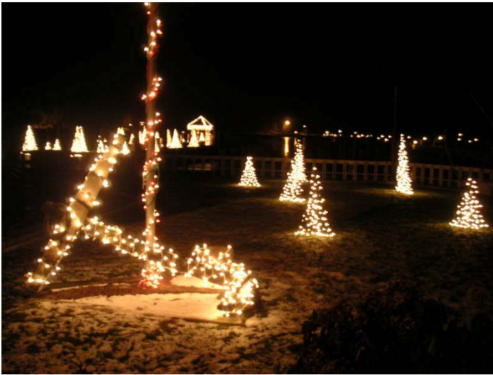
Anchor, Flagpole and Gas Dock (2007-8)

The entire crew at Eldean Shipyard wishes you a Happy Holiday Season and a Happy New Year! Thank you for choosing Eldean Shipyard! If you live in the area, be sure to stop in the Piper or drive by at night to see our display of Holiday Lights.