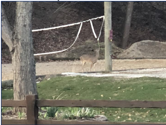
Unauthorized user of the volleyball court

Our sand volleyball court doesn't get a lot of use, so some of you might have wondered why we needed that nice new net? Well, although the wind probably had a lot to do with it, the deer below decided to get in on the action this past spring, gnawing away at the bottom of the net and rope. The new net has a steel cable, both at top and at bottom, so I'm hoping it will be both wind and deer proof. Now does anyone know how to deer proof our flowers?