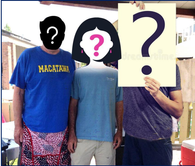
Who will be cooking at the Labor Day Picnic?

Please join us for our complimentary Holiday Picnic, 12-2:30, on Sunday, September 5 th at the playground picnic area. The crew will be firing up the grills and cooking sausages, chili-dogs, and grilled fish for all of our Boaters and guests. Chips, Water, and Cold Beer will also be provided; Ice Cream Bars Too!!!