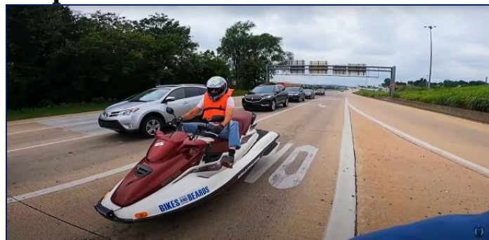
So, I was thinking we could make...

Yep, he did get pulled over, but it sounds like it was actually street legal, so they were able to keep boating on the highway. If you have an old Wave Runner, all you need is a gear-head, a scooter, and 5 days to make the conversion. For more info on this creation, click here .