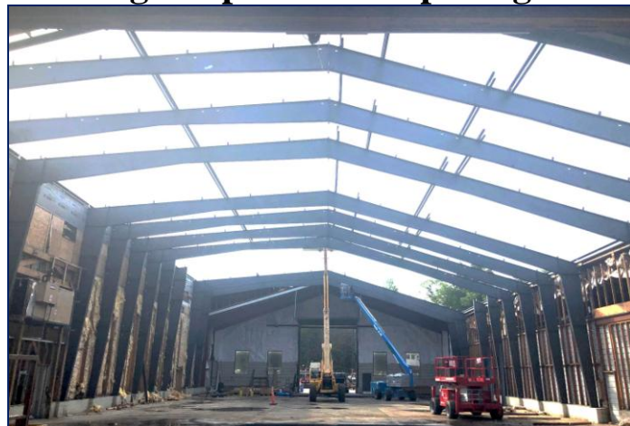
In progress view of storage building #6 construction

CL Construction (members on A-dock) are busy assembling the new steel storage building that is replacing the back half of building #6, a 12,500 sq. ft. section. It has taken a couple of years of back-n-forth with our insurance company before we could come to an acceptable solution, but in just a month or so, our new and improved winter storage building will be ready for heated storage for you boat! Besides the structural and long term benefits of the engineered steel building, there will be more head room and better lighting and natural light. Interestingly, CL Construction was on the scene back in 1958 and 1959 when the original wood building was built (Grandfather Lamar was the builder at that time) and the same Lamar family have built all of our storage buildings in Macatawa.