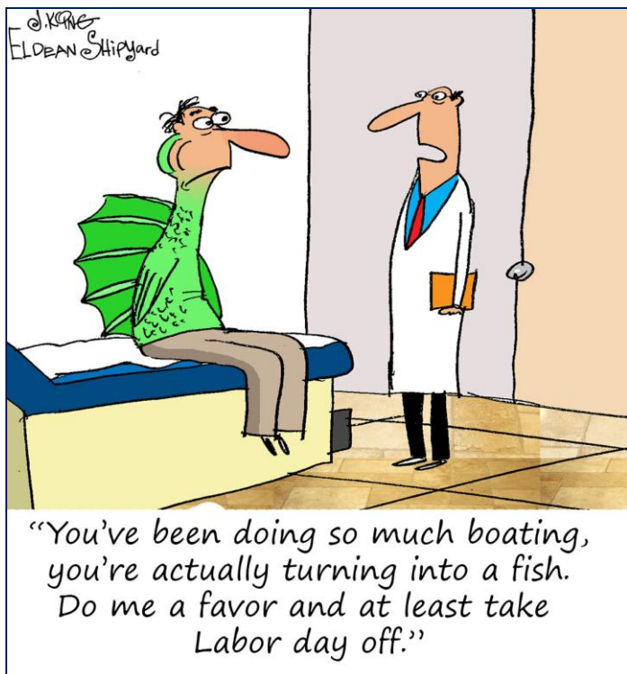
Is this happening to anyone your family?