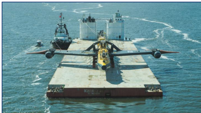
Ready for Take-off/Launch

It may look more like a plane on an aircraft carrier than an electricity producing bobber, but this floating machine is able to produce clean renewable energy for 2000 households in the UK. It is a powerful tidal turbine created by Orbital Marine Power that takes advantage of 7.8 knot spring tides around the northeastern point of Scotland. Orbital Marine Power plans to bring this concept to a current near you! For more photos and information, click here .