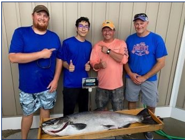
New state-record Chinook salmon tops 47 pounds