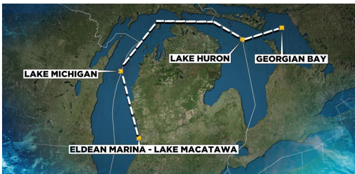
The sail drones' basic route as they capture fish data