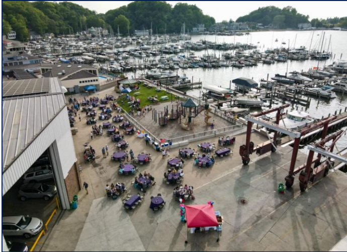
50 th Anniversary picnic photo from Kirk (E-17)