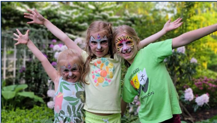
Sisters' faces painted at the 50 th Anniversary Party (A-4)