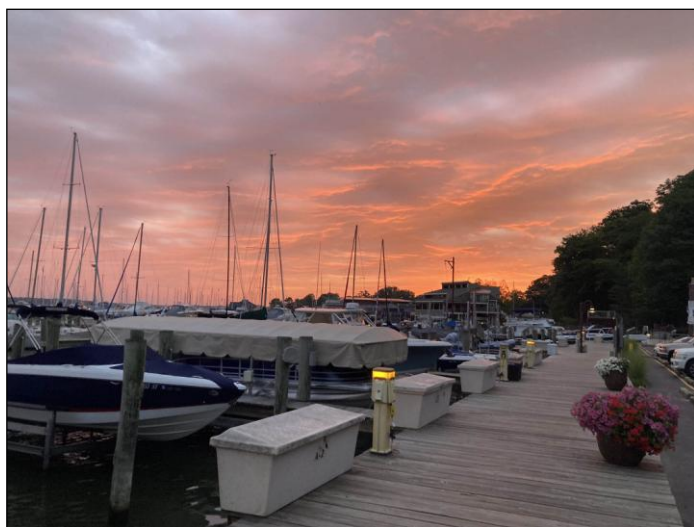
Sunrise from A Dock Boardwalk (from Wade)