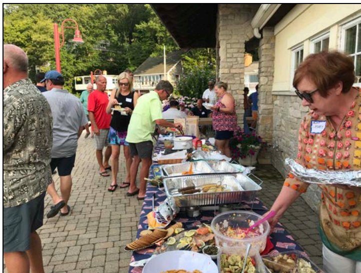
The A & Z Dock Party, 2018