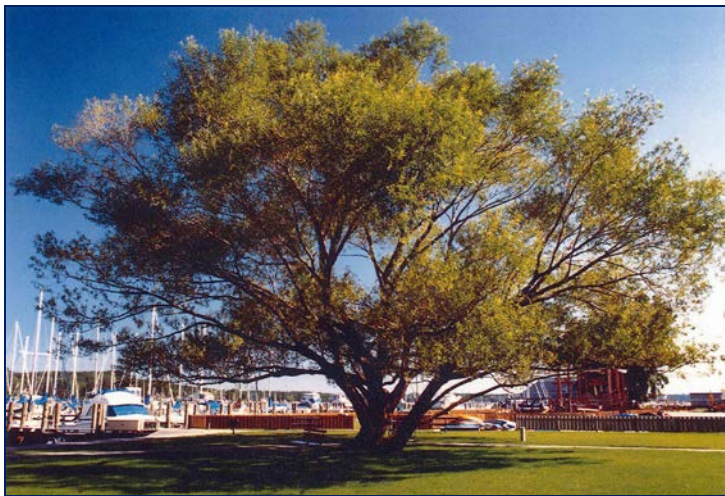
Do you remember our Willow Tree?