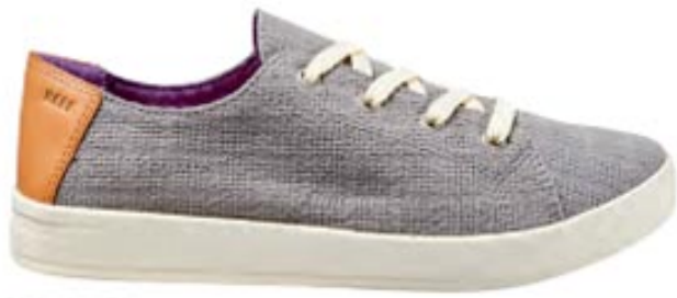
Reef Shoes and Sandals

This year's clothing selection is arriving in the Shipstore. You'll see that we brought back a few favorites this year along with a variety of new Macatawa Clothing and expanded lines of Gill apparel.