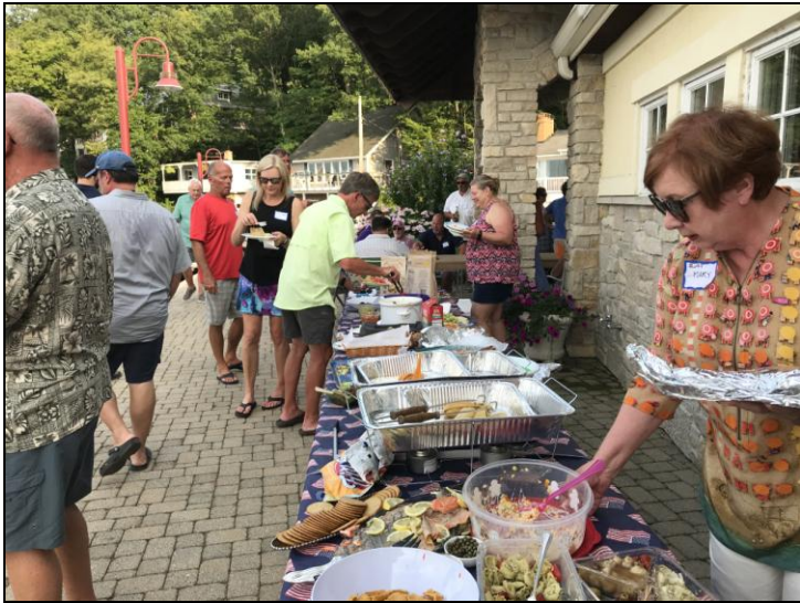
The A & Z Dock Party, 2018

The PIG OUT Truck will be serving lunch on Saturday, July 20 th from 11:30-2 near the playground. For the menu, go to pigoutonthefly.com