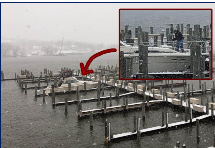
Who keeps a snow shovel aboard their boat?

There is the possibility of launching too early and getting stuck in some nasty spring snow storms. One of earliest arrivals this year woke to 4" on the deck and had to broom it off?