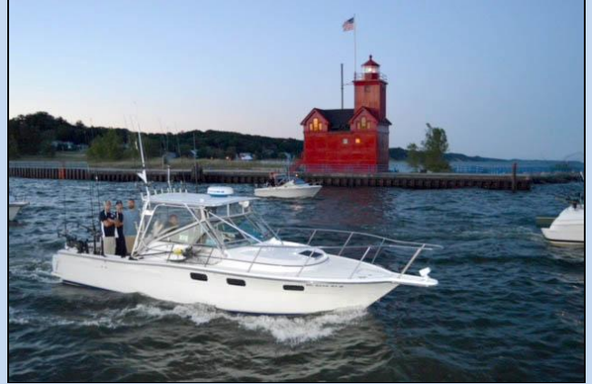
Captain Mark aboard the Black Pearl!

Remember that May is an excellent month for a mix of all five species (Brown Trout, Lake Trout, Steelhead Trout, Coho Salmon, and Chinook Salmon) and one of my favorite months to be on the water! The crew at Black Pearl Sportfishing look forward to guiding you on your Lake Michigan adventure.