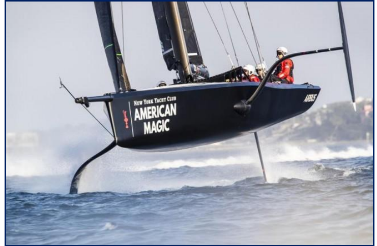
AMERICAN MAGIC is the other USA Team competing

The second Americas Cup challenger from the United States, Team Stars & Stripes, is being built right here in Holland, Michigan. Composite Builders, a local marine manufacturer that has specializes in custom work and carbon fiber is building the hull! They have flown in many experts to help with the build, and a few of them have been staying in one of our marina’s Vacation Rentals this winter.