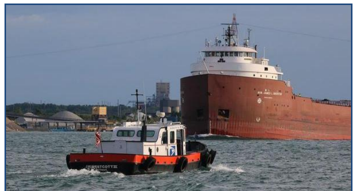
Mail delivery to/from Zip Code 48222

Do you know there is a post office floating around the Detroit River delivering Amazon packages and US Mail to passing by freighters? The service was started in 1874 and employed a row-boat and a put-your-mail-in-a-pail technique to pick-up and make deliveries. It became an official post office in 1895 and the boat, the 45' J.W. Wescott, has its own Zip Code. If you want to send a thank you note to that nice freighter captain who didn't run over you, address your letter to their Vessel's name, Marine Post Office, Detroit, Michigan 48222.