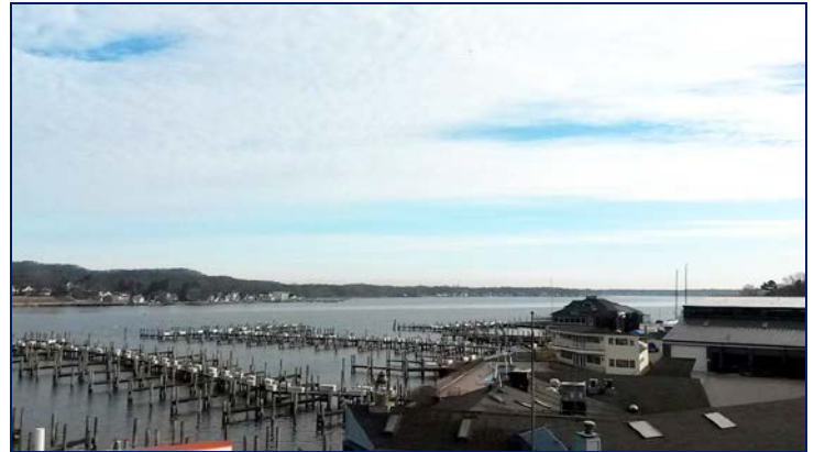
View from the Roof Top Deck of Harbor View #2

The transformation of the Piper Restaurant into 3 residential apartments and a restaurant space continues. Harbor View Lofts #2, with 7 bedrooms, will be completed shortly and available for summer weekly rental. If you have any interest just let me know. Additional information is available at: