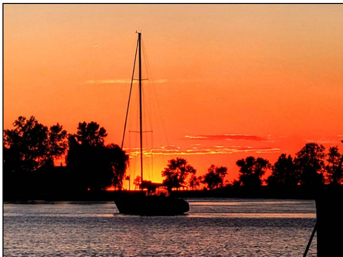
And with brighter orange and other adjustments