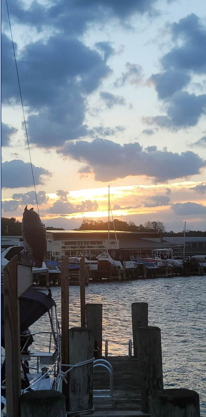
Sunrise from A-dock (from Ben)