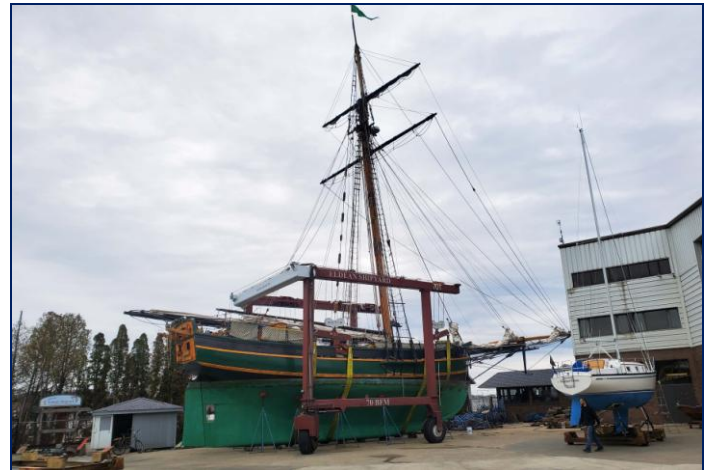
A very Tall Ship (from Brian)