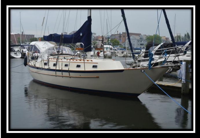
1999 Pacific Seacraft 37

This is exceptional example of a well maintained used boat. Over the years, much care has been provided by the owner & Eldean Shipyard.