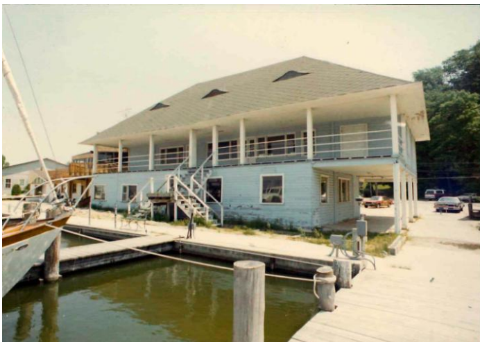
Our old Shipstore was also the old MBYC Clubhouse. It was rolled down the road on pilings. Gas Dock on right.