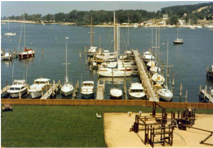
Late 70's - A smaller E-dock and the Wood Playground