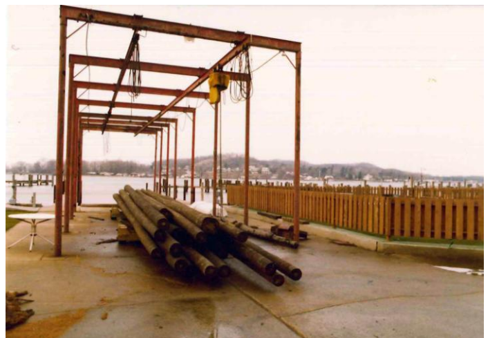
This lift was just west of the playground at the dingy ramp.