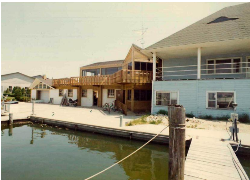
1976 – The new and current Shipstore (brown) was built before the old one was torn down (blue)