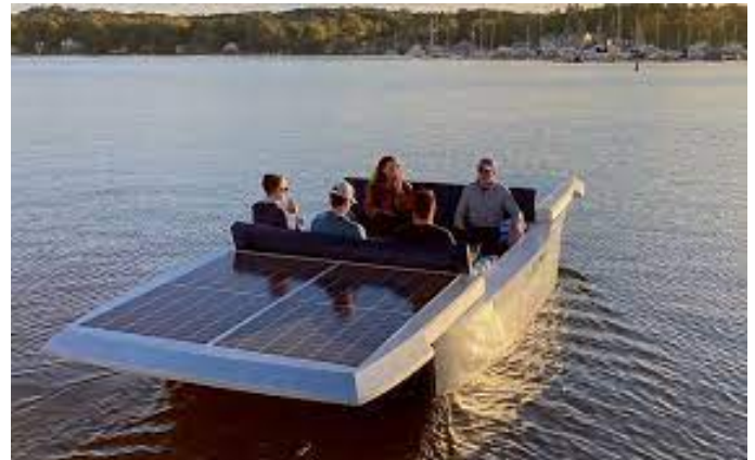
Test-drive, Saugatuck Michigan, September 2022

This innovative concept boat was developed with the help of Michigan EGLE to be a carbon free boating experience. The batteries are recycled Prius batteries that are repurposed at a local Holland business. Most everything on the boat, besides the solar panels, is made from recycled materials. One might find a Lily Pad for rent in Saugatuck in the near future! To read the article from EGLE, click here . To see the the Lilypad transform from singular rectangular solar panel to a boat with seating, check the Lily Pad website at lilypad-labs.com .