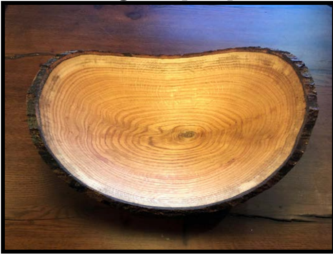
A selection "Big Red" Oak Bowls are in the Shipstore!

We have bowls carved from Maple and Red Oak trees from our Marina Property. The new set of Red Oak bowls are stamped on the back with the Big Red Lighthouse. What a great gift: A Big Red themed bowl carved at the Holland Bowl Mill from a Big Red Oak Tree from Macatawa! Bowls range from $15 to $400. The big bowls are amazing and rare! Act fast and there will be time for the Holland Bowl Mill to add a personalized message or design!