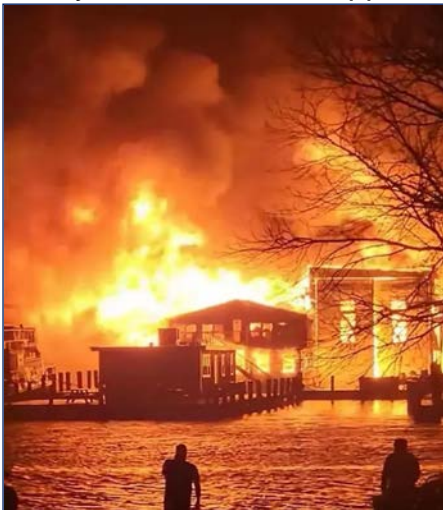
Boatyard Fire, Mystic River, Connecticut

This is a nightmare of both boat owners and boatyard owners. It appears that this fire at