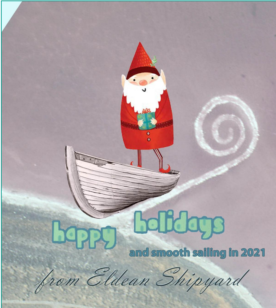
Photo: Santa arriving by skiff at Spiral Jetty on the Great Salt Lake

Wishing You and Yours a Healthy Holiday filled with Joy, Family, and Friends!