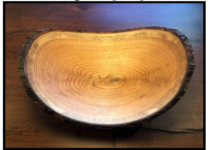
A selection "Big Red" Oak Bowls are in the Shipstore!

We have had a 2 nd run of bowls carved from Maple and Red Oak trees from our Marina Property. The new set of Red Oak bowls are stamped on the back with the Big Red Lighthouse. What a great gift – A Big Red themed bowl carved at the Holland Bowl Mill from a Big Red Oak Tree from Macatawa! Bowls range from $15 to $400. The big bowls are amazing and rare!