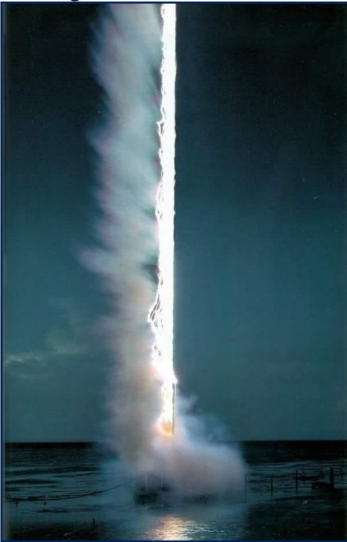
The moment when lightning strikes a sailboat