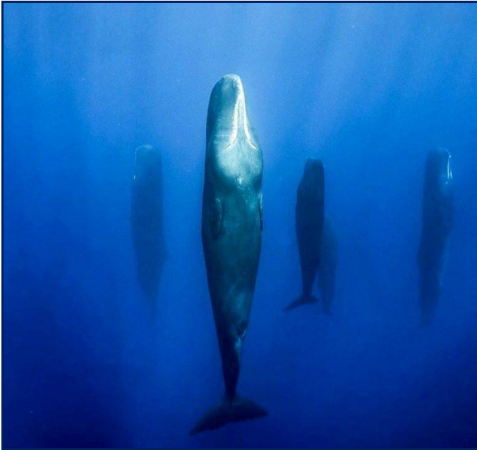
Sleeping Sperm Whales

Thanks to photographer and diver Stephane Granzotto there are these amazing photographs capturing a pod of sperm whales sleeping. The whales reportedly sleep for up to 2 hours at a time, between breaths, and in a vertical position about 45' underwater. Click here to see more photos and info.