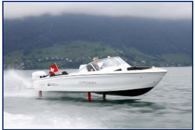
The Candela Seven

Had you been vacationing in Switzerland this past September, you might have wondered what that Unidentified Flying Object was on the lake in front of your villa? It was the first ever eclectic powered hydrofoil speedboat, pictured above. The Candela Seven is a 25' speed boat that can reach 34 mph, has a range of 56 miles on a charge, and starts at $296,000. The biggest benefits from a hydrofoiling boat are gained because the contact with water is minimized leading to a very efficient propulsion and energy use. Additionally, your passengers won't be complaining of sea-sickness as the boat won't be bounced around by the waves when flying above the water! For more information go to Cadelaspeedboat.com .