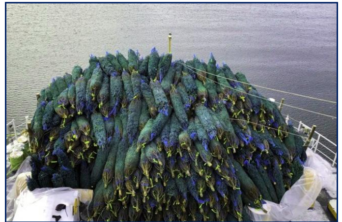
Christmas Trees Sail from Michigan to Chicago

We have had a 2 nd run of bowls carved from Maple and Red Oak trees from our Marina Property. The new set of Red Oak bowls are stamped on the back with the Big Red Lighthouse. What a great gift – A Big Red themed bowl carved at the Holland Bowl Mill from a Big Red Oak Tree from Macatawa! Bowls range from $15 to $400. The big bowls are amazing and rare!