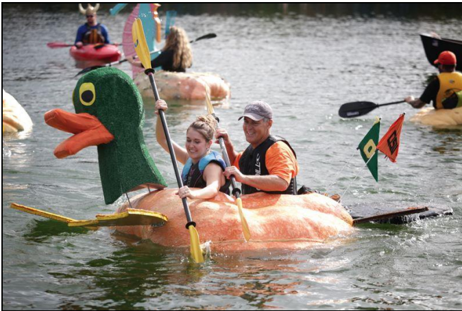
Saugatuck's Duck Boat has Competition