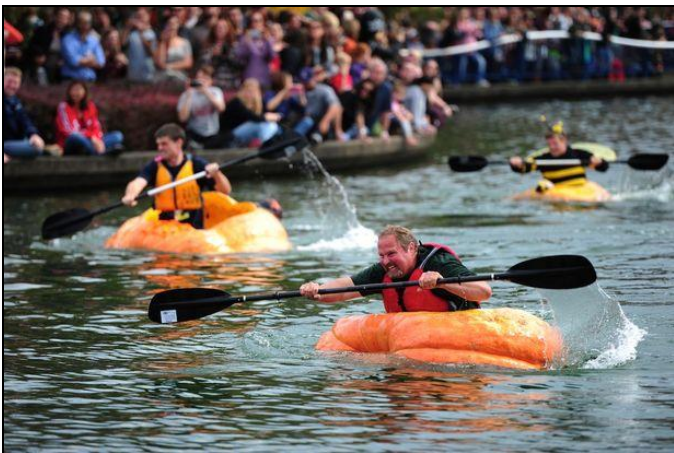
This guy means business!