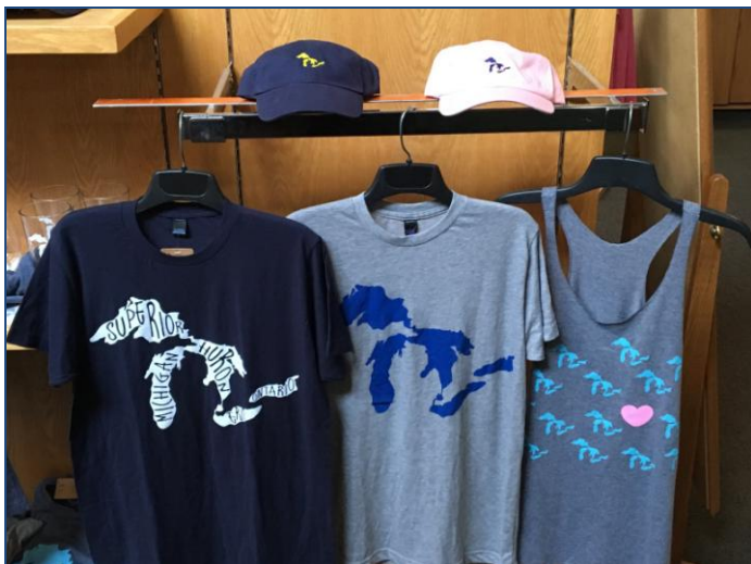
A NEW selection of Great Lakes T's & Hats are in the Shipstore!