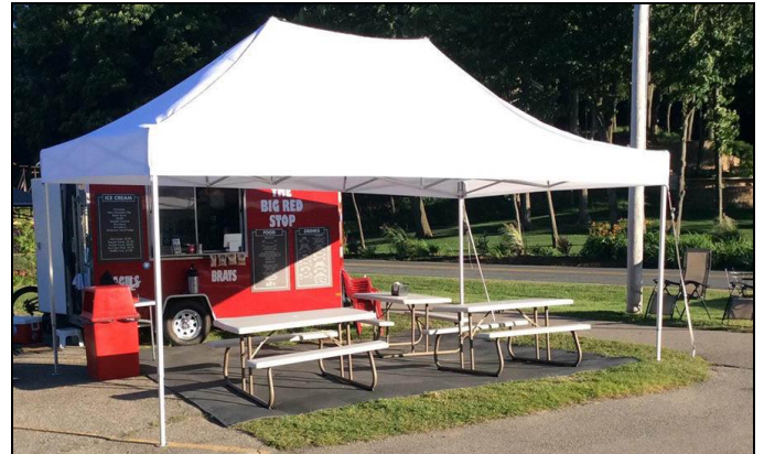
Open for business in 2018? I hope so!