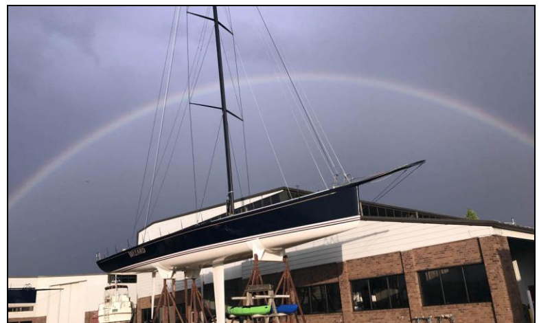
"Wizard" under a rainbow this summer