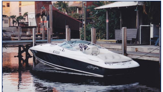
Roger Eldean's Baja is for sale

Now that winter is here it is also time for Boat Show Season. The recent Fort Lauderdale International Boat Show was well attended and resulted in very strong sales activity. The show featured an estimated seven miles of floating docks and 1,200 exhibitors from 35 countries. There are also some great boat shows coming up after the Holidays. The Chicago Boat, RV & Sail Show will return to McCormick Place January 10-14, 2018 with the newest model boats and the latest gear. Miami International Boat Show will be held at Miami Marine Stadium February 15-19, 2018, where you will be able to see more than 1300 boats on display on land and in the water. Closer to home will be the Grand Rapids Boat Show at the DeVos Place February 14-18, 2018. All these shows are great places to check out the latest boats and the newest gear.