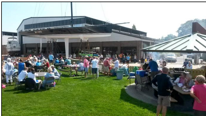
The Labor Day Cookout was a ton of fun!

Did you know that there are important fresh water reefs in the Great Lakes? Although the fresh water shark is an urban legend, fresh water reefs do exist and many are important breeding habitats for fish. Buffalo Reef, a massive 2200 acre reef in Lake Superior that supports the spawning of both Whitefish and Lake Trout populations is under attack. The reef is currently threatened by being covered from drifting Stamp Sands – a waste material produced in the copper ore mining process that was common in the early 1900's. Because of the drifting sands, the EPA is providing $3.1 million to the Army Corps of Engineers for dredging work. Click here to read more about this project.